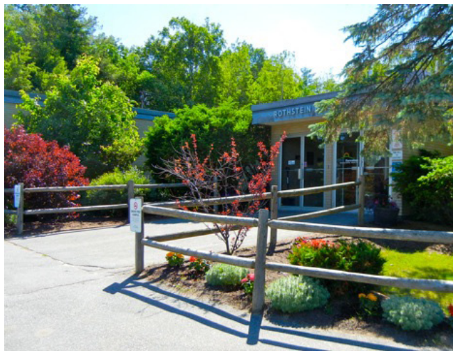
Waterville Clinic and Administration offices, located at 67 Eustis Parkway, Waterville.

The Chamber award was presented at a business-community gathering April 29 at the Elks Banquet & Conference Center in Waterville. Kennebec Behavioral Health's mission is to promote the well-being of persons who experience mental illness, emotional difficulties or behavioral challenges.