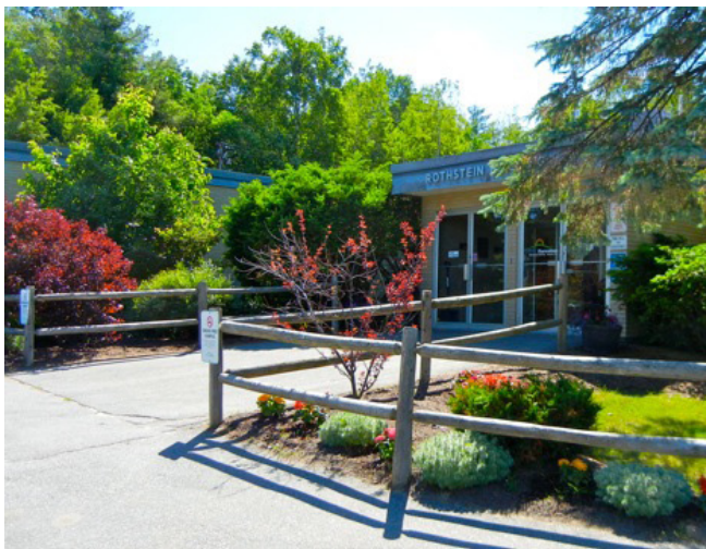
Waterville Clinic and Administration offices, located at 67 Eustis Parkway, Waterville.

The Chamber award was presented at a business-community gathering April 29 at the Elks Banquet & Conference Center in Waterville. Kennebec Behavioral Health's mission is to promote the well-being of persons who experience mental illness, emotional difficulties or behavioral challenges.